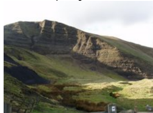
Mam Tor (The Shivering Mountain, near Castleton)